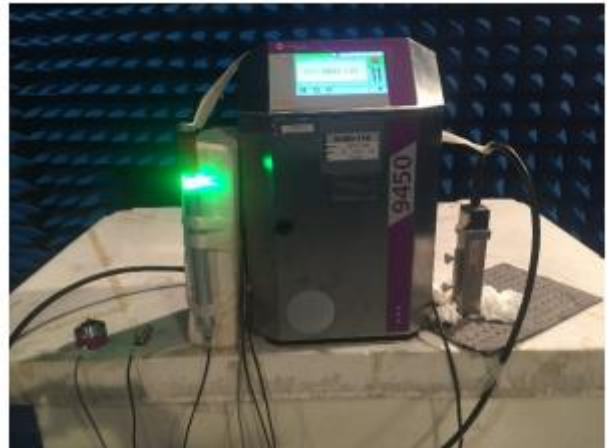
Test setup in anechoic chamber