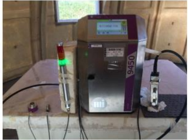
Test setup on OATS