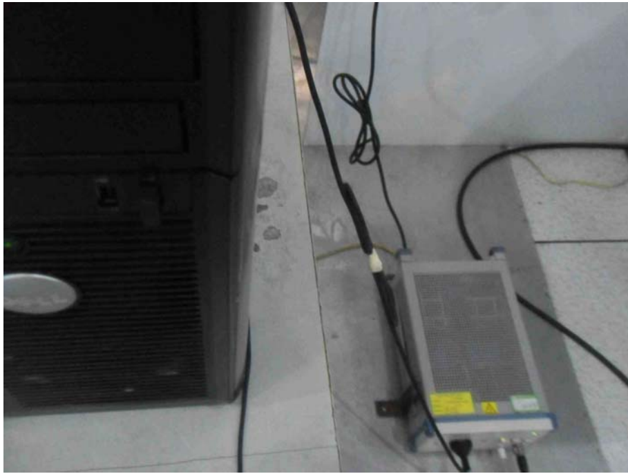
2. Photo of Radiation Emission Test