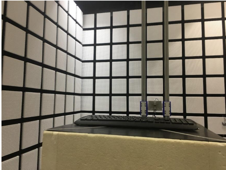
Radiated emission (Above 1GHz)