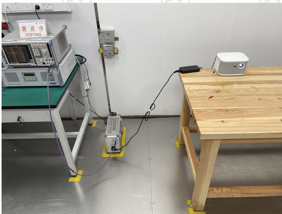
AC Power Line Conducted Emission