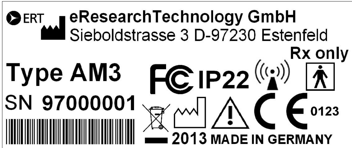
Exhibit: Label Sample