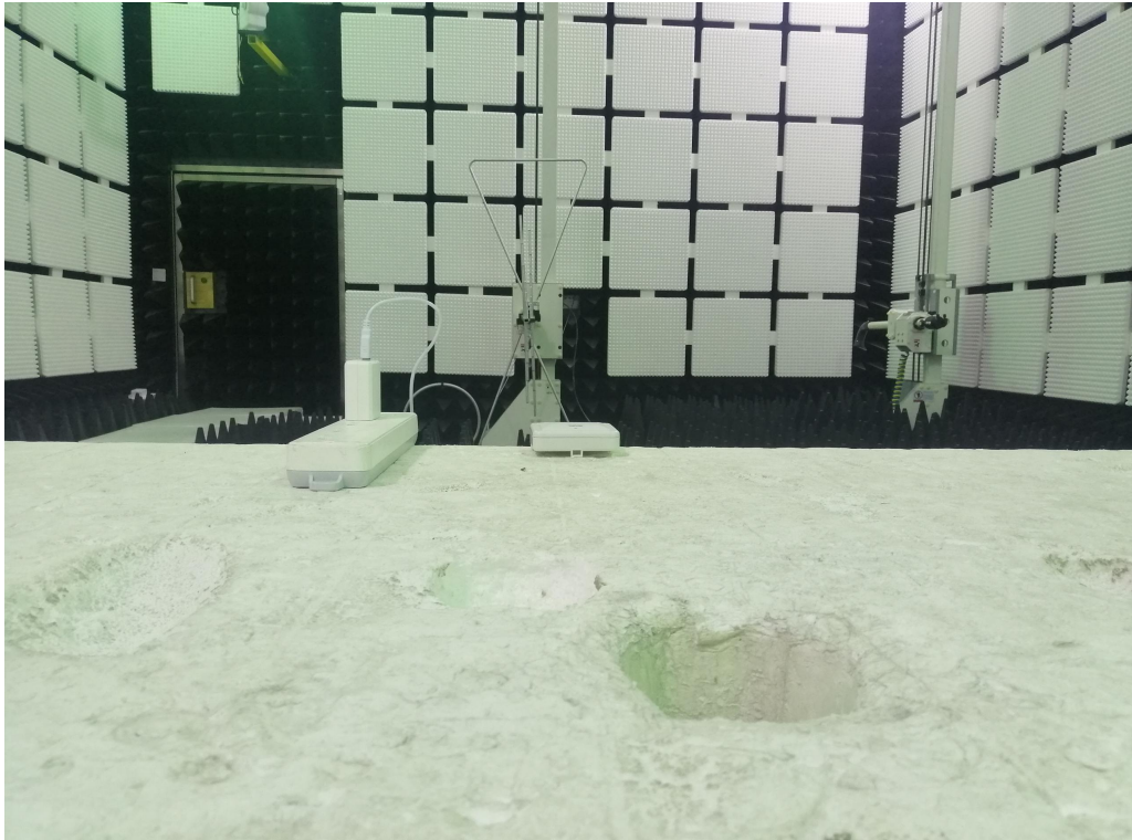
Fig. 1 (Adapter Model: XSC-0501000SU)