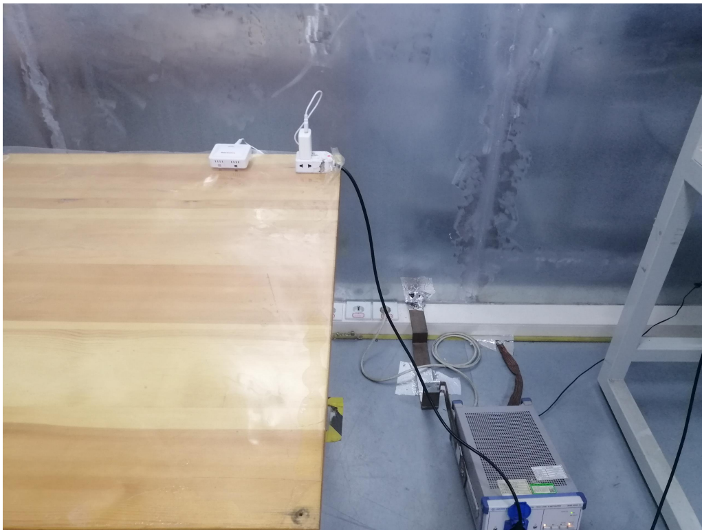
Fig. 2 (Adapter Model: HX075B-0501000-CU)