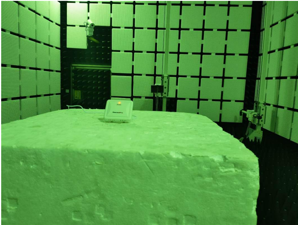
Fig. 3 (Adapter Model: XSC-0501000SU)