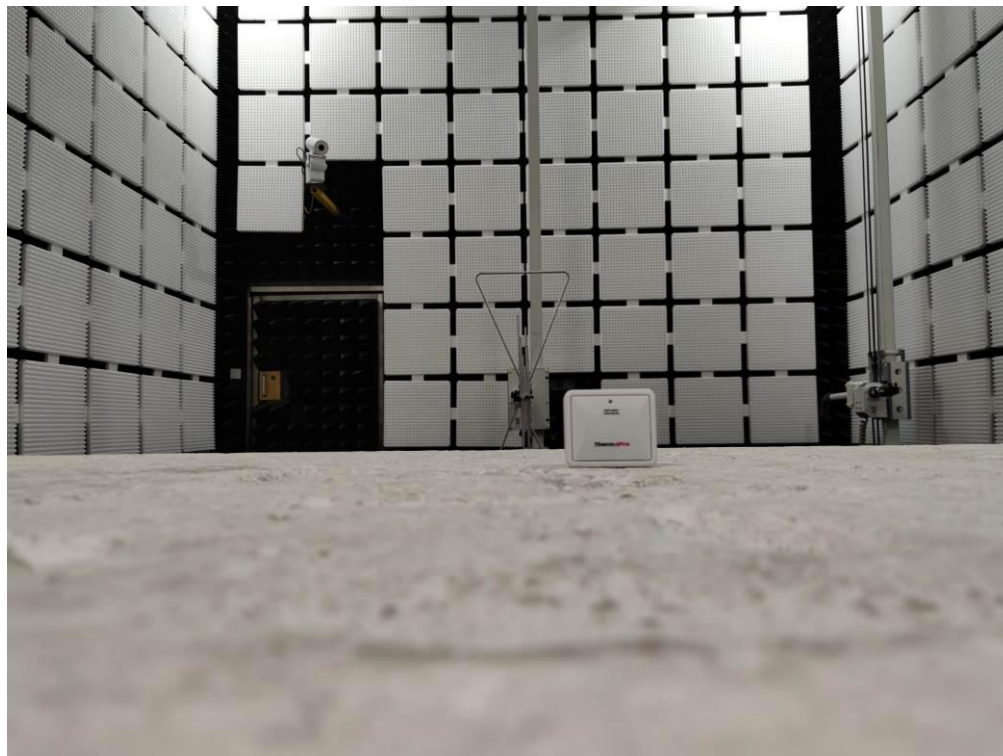
Below 1 GHz