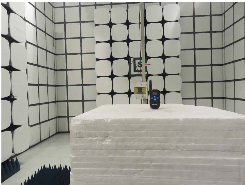
Spurious Emission above 1GHz