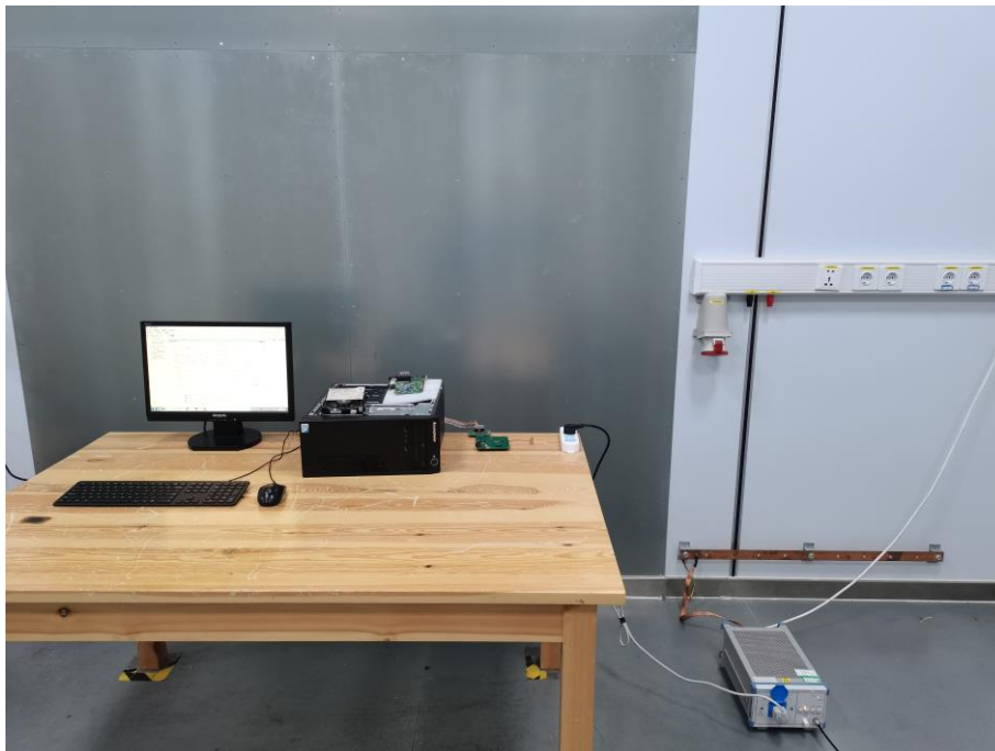
Fig. 4 Power line conducted emission setup photo