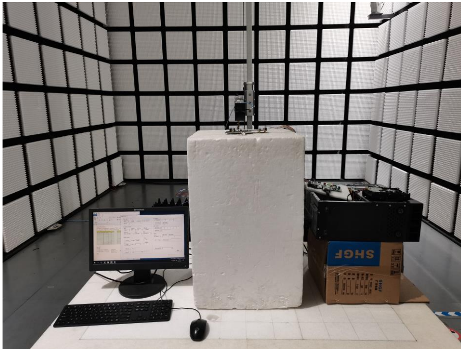
Fig. 3 Radiated emission setup photo(Above 1GHz)