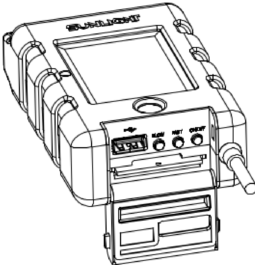
BMS Display image.