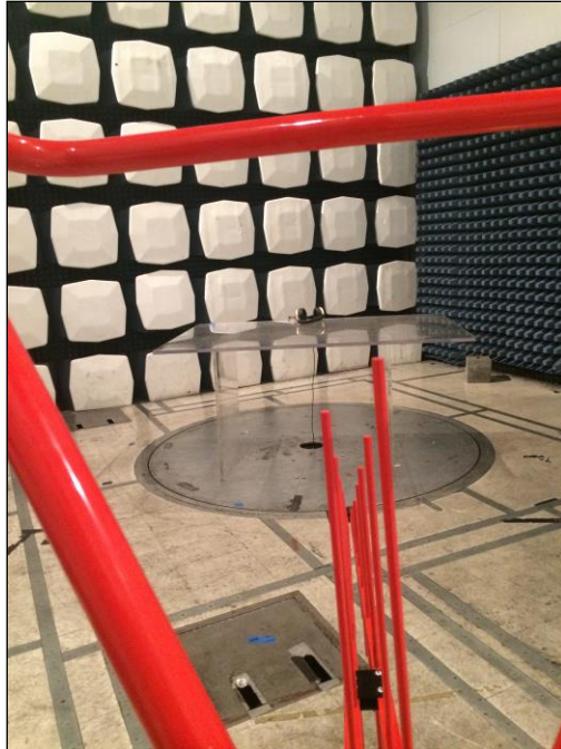
Photograph 1. Radiated Spurious Emissions, 30 MHz - 1 GHz, Set up Photo