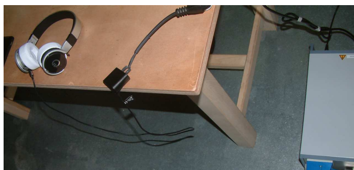
Battery charging (Tx mode)