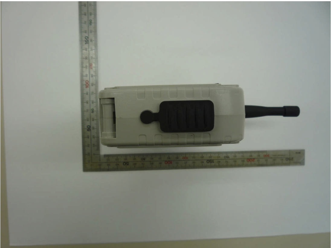
Side view (Left)