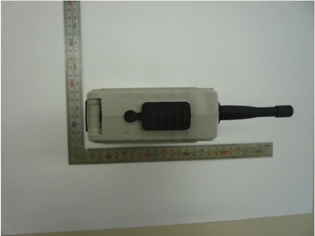
Side view (Right)