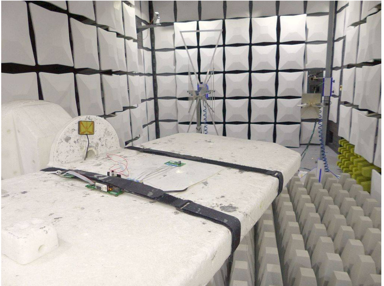
Photo 3: Test setup for radiated measurements (Enclosure, fully-anechoic chamber, 1-26 GHz, intentional radiator §15, ANSI C63.10)