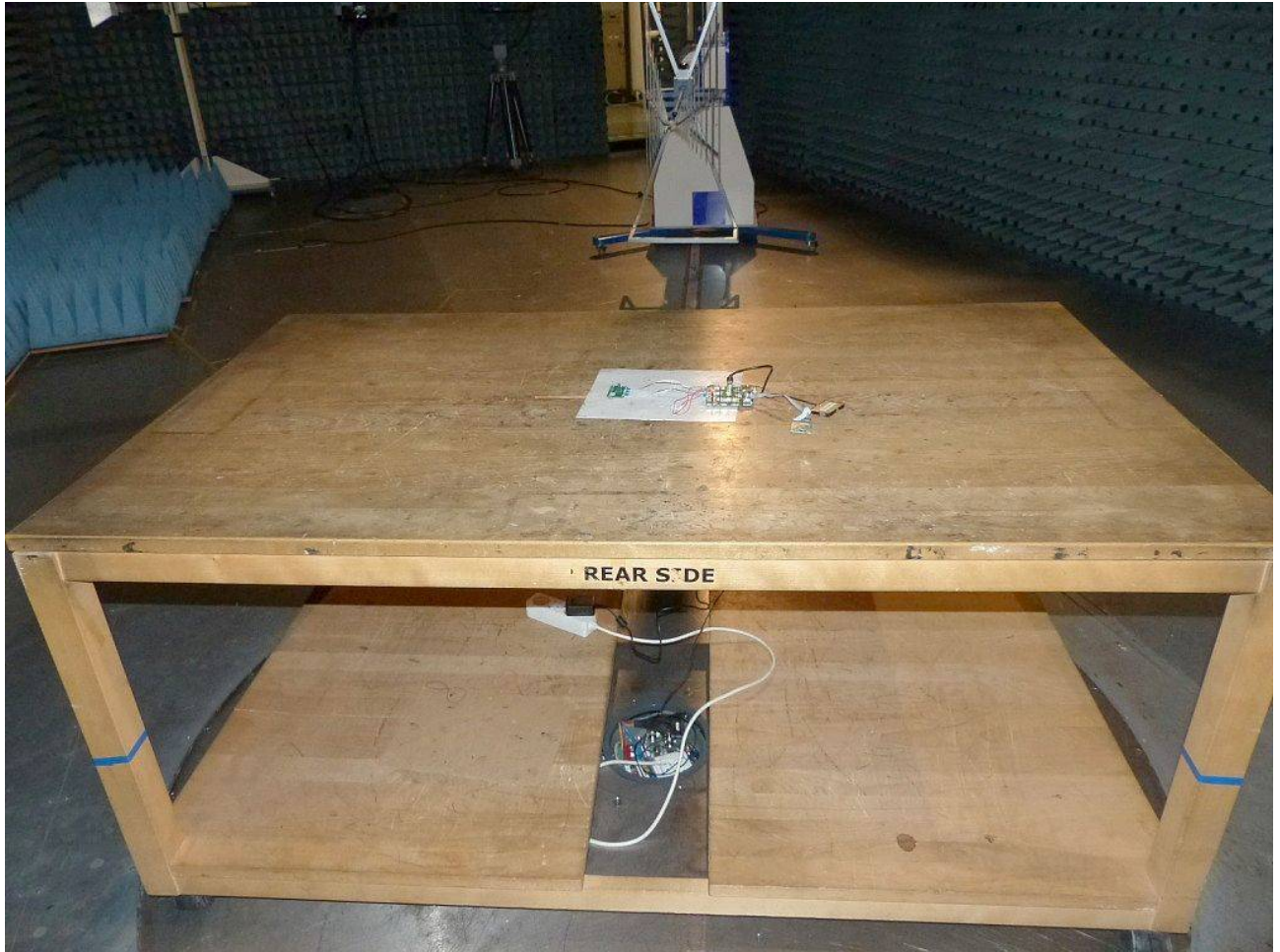
Photo 2: Test setup for radiated measurements (Enclosure, semi-anechoic chamber, 30 MHz to 1 GHz, intentional radiator §15, ANSI C63.10)