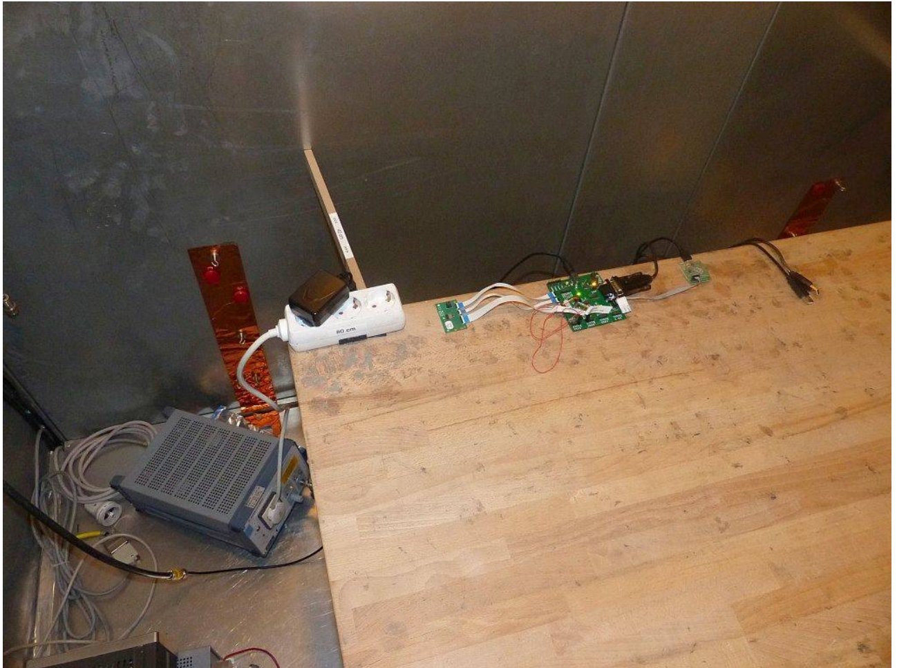
Photo 4: Test setup for conducted measurements (AC Port (power line), EUT supplied by AC/DC adapter, intentional radiator §15, ANSI C63.10)