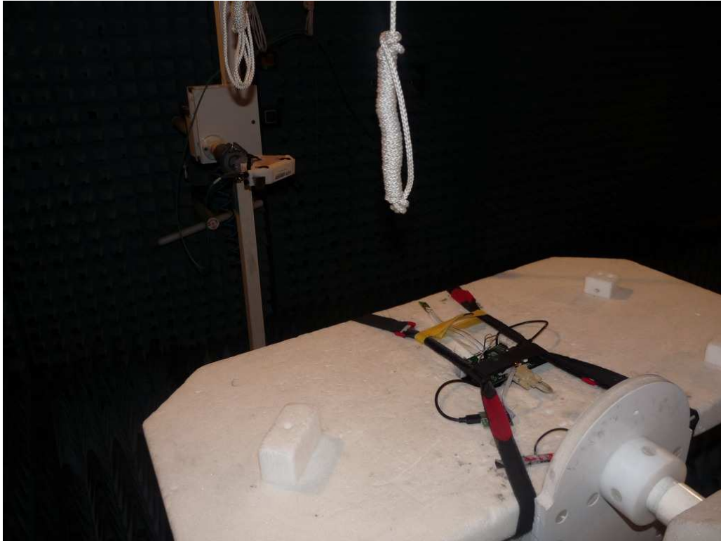
Photo 4: Test setup for radiated measurements (Enclosure, fully-anechoic chamber, 18-25 GHz, intentional radiator § 15)