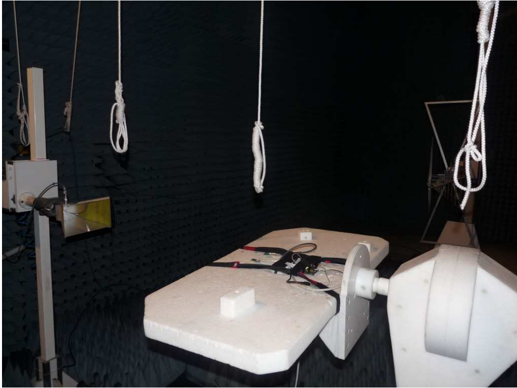
Photo 3: Test setup for radiated measurements (Enclosure, fully-anechoic chamber, 1-18 GHz intentional radiator §15 / 30 MHz – 10/20 GHz §22/24/27)