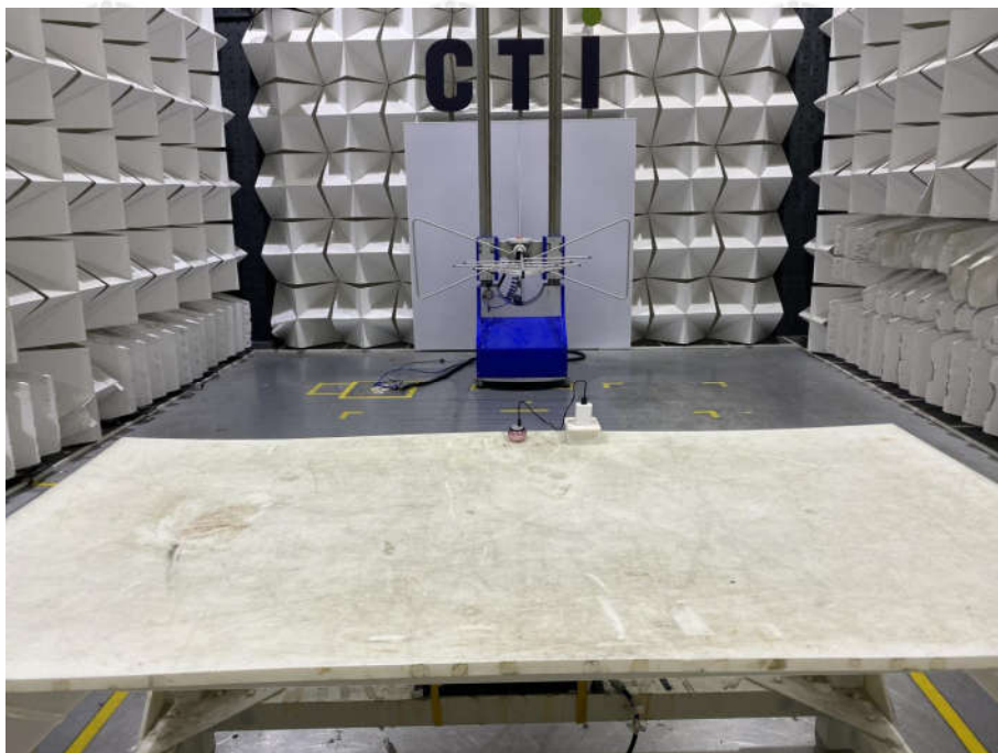
Radiated spurious emission Test Setup-2 (Below 1GHz)