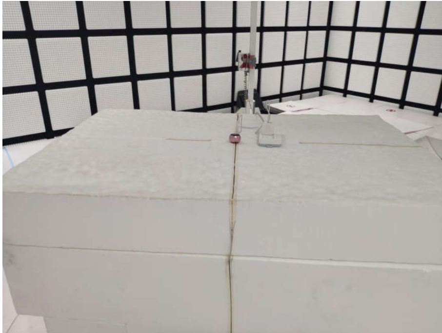
Radiated spurious emission Test Setup-3(Above 1GHz)