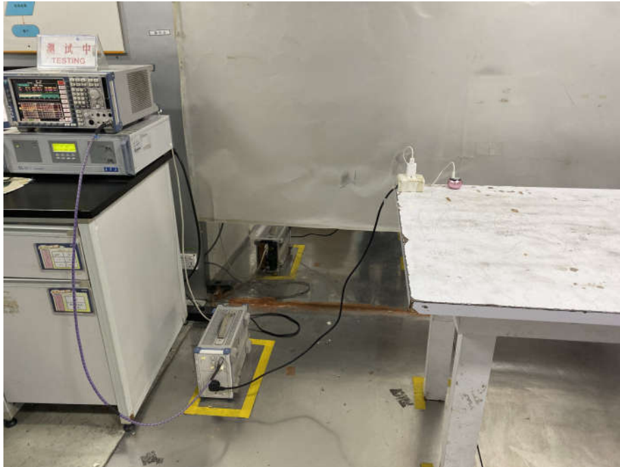
AC Conducted Emissions Test Setup