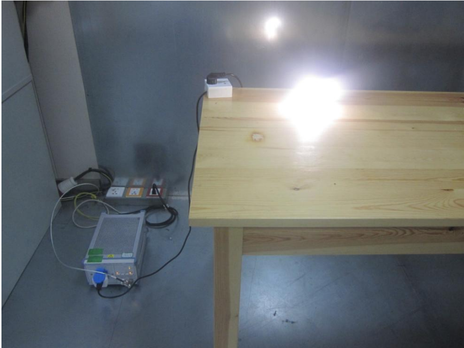
DTS radiation L