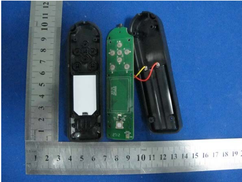
Photo 6 Appearance of PCB