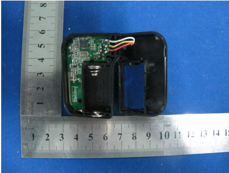
Photo 5 Appearance of PCB