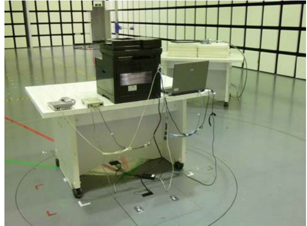
Rear (9 kHz - 30 MHz) Loop antenna: Horizontal