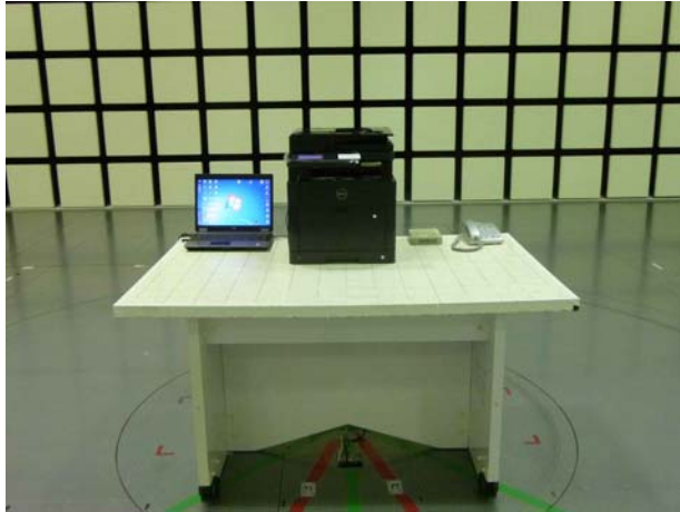
Front (9 kHz - 1000 MHz)