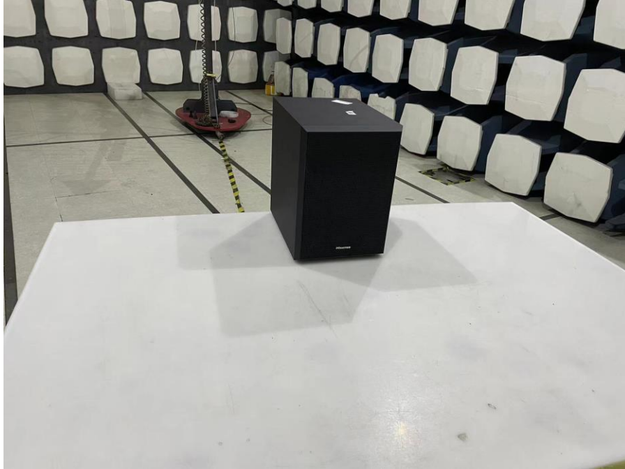
Back View (Below 1GHz)