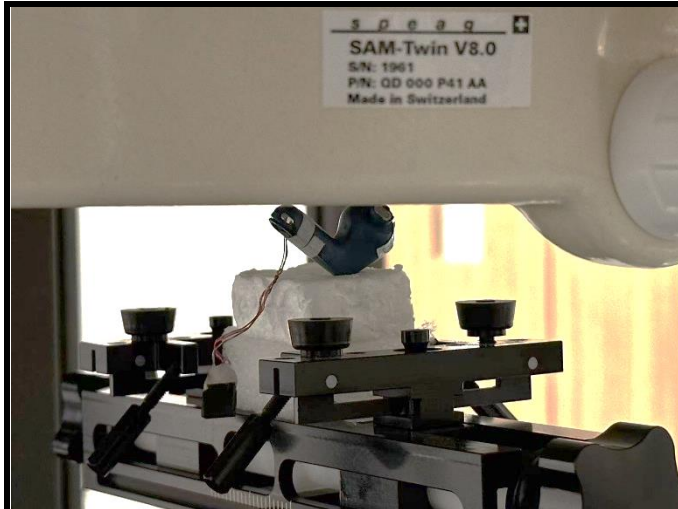
Inside of Left Earphone with 0 cm Gap