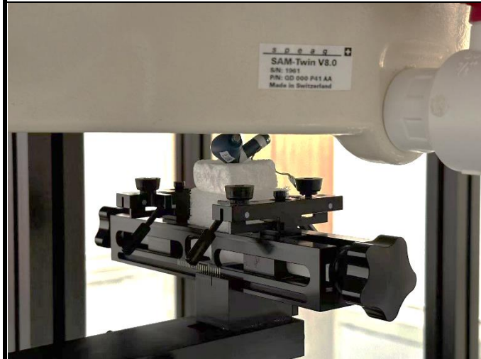
Inside of Right Earphone with 0 cm Gap