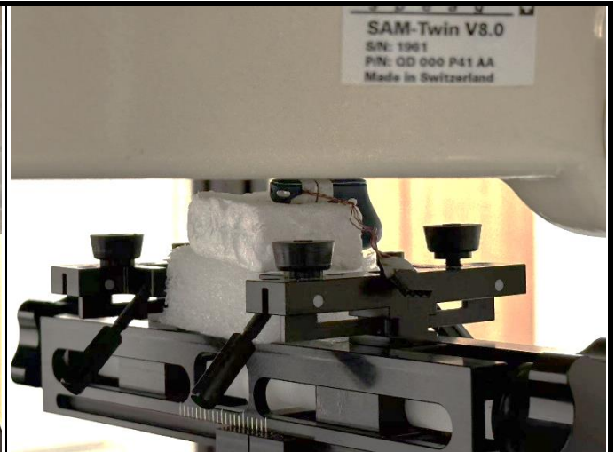
Rear Face of Left Earphone with 0 cm Gap