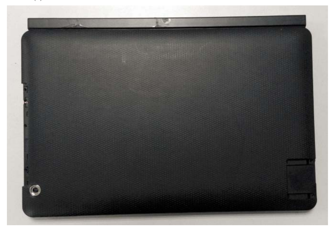
keyboard with tablet 2 in 1

tablet be ready connect to keyboard review Picture (3)