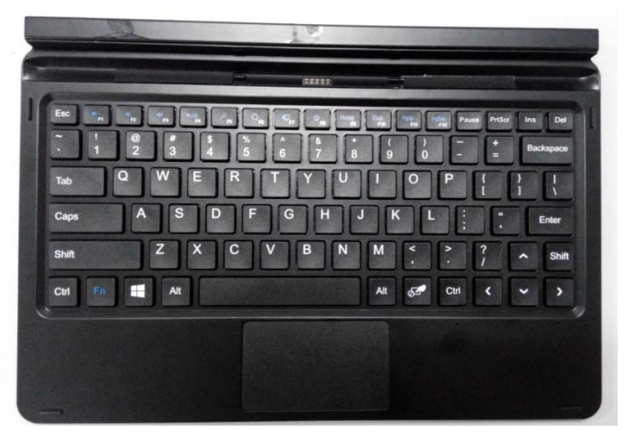
Keyboard review Picture(3)