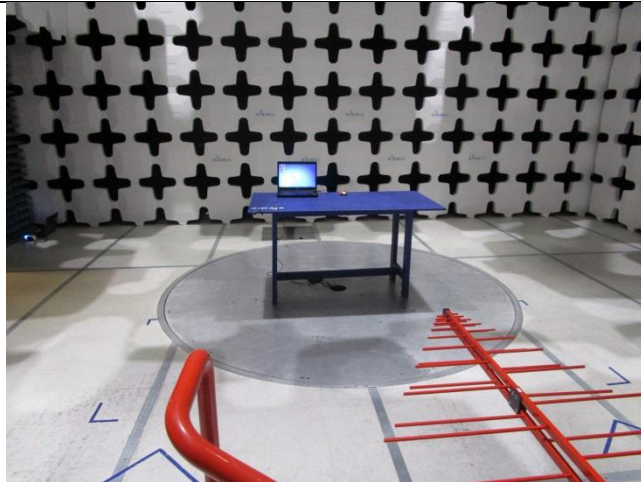
Radiated Emissions (<1GHz) – Front View