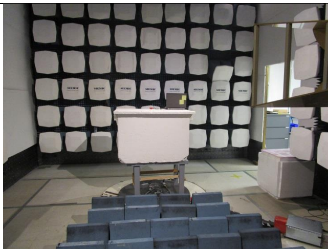
Radiated Emissions (>1GHz) – Front View