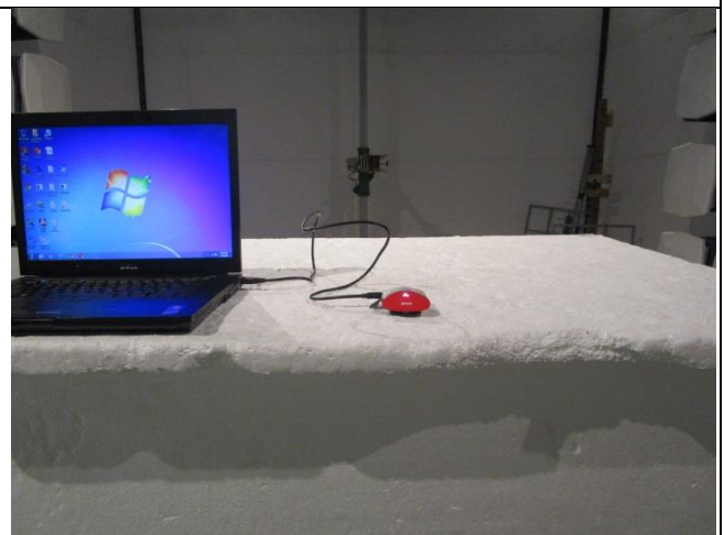
Radiated Emissions (>1GHz) – Rear View

Note: The spurious emission in different EUT orientation was investigated, including the EUT standing up position and the laying down position. The EUT orientation shown in above setup photo is the worst case position.