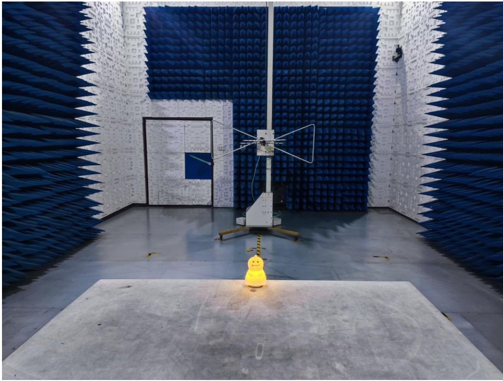
RADIATED EMISSION TEST SETUP ABOVE 1GHz