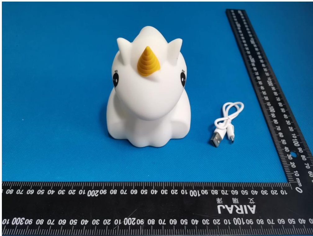
All VIEW-2 OF EUT