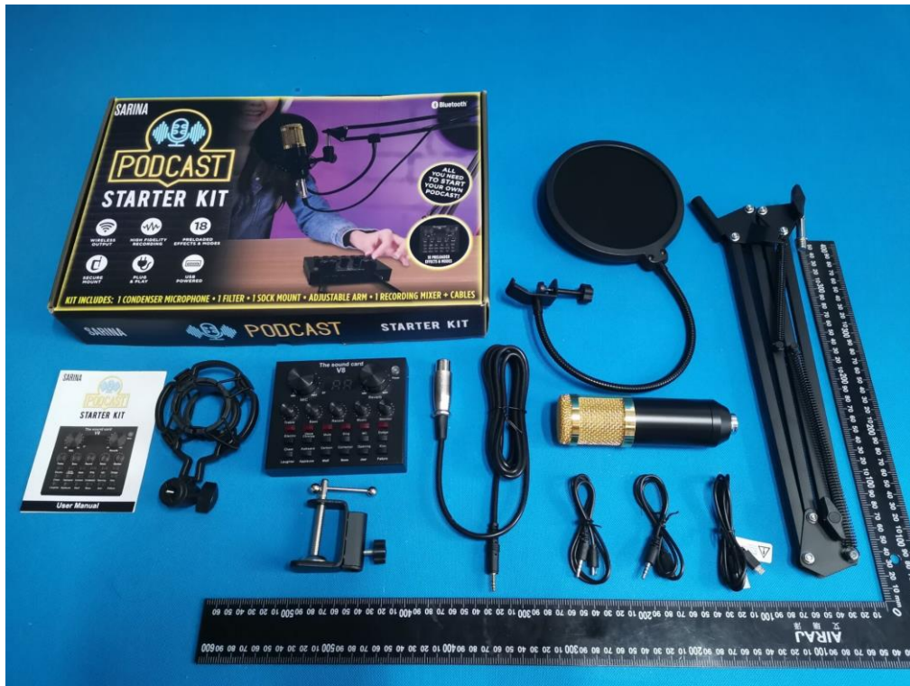
All VIEW OF EUT-2