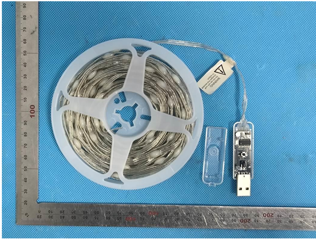
INTERNAL VIEW OF EUT-1