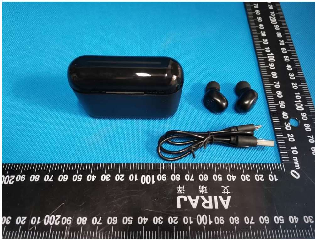
ALL VIEW OF EUT (FIGURE 2)