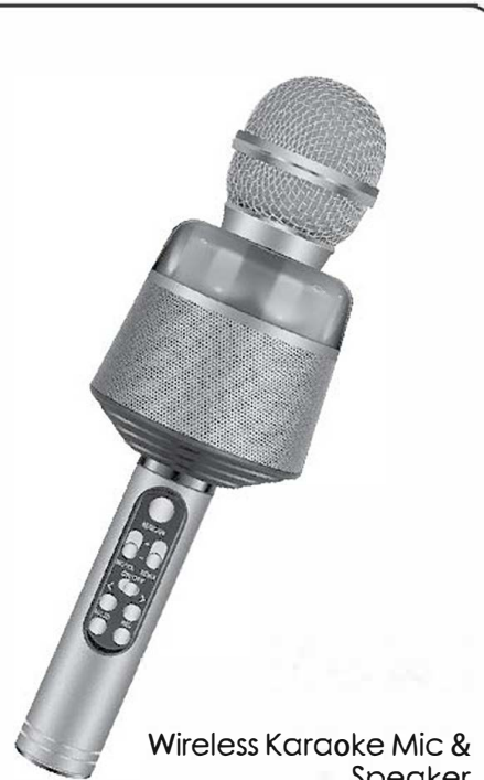
Wireless Karaoke Mic & Speaker