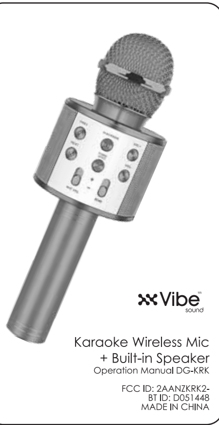
Karaoke Wireless Mic + Built-in Speaker Operation Manual DG-KRK

FCC ID: 2AANZKRK2- BT ID: D051448 MADE IN CHINA