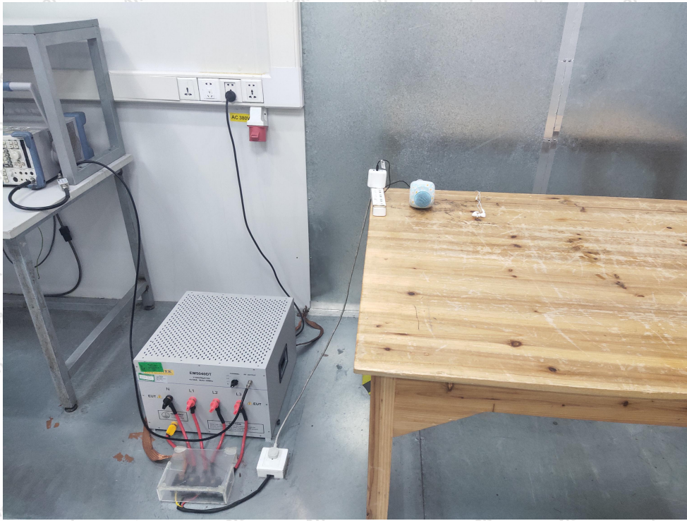
Photo of Radiation Emission Test