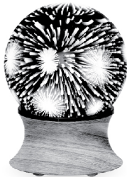
Operation Manual SA-FPRI