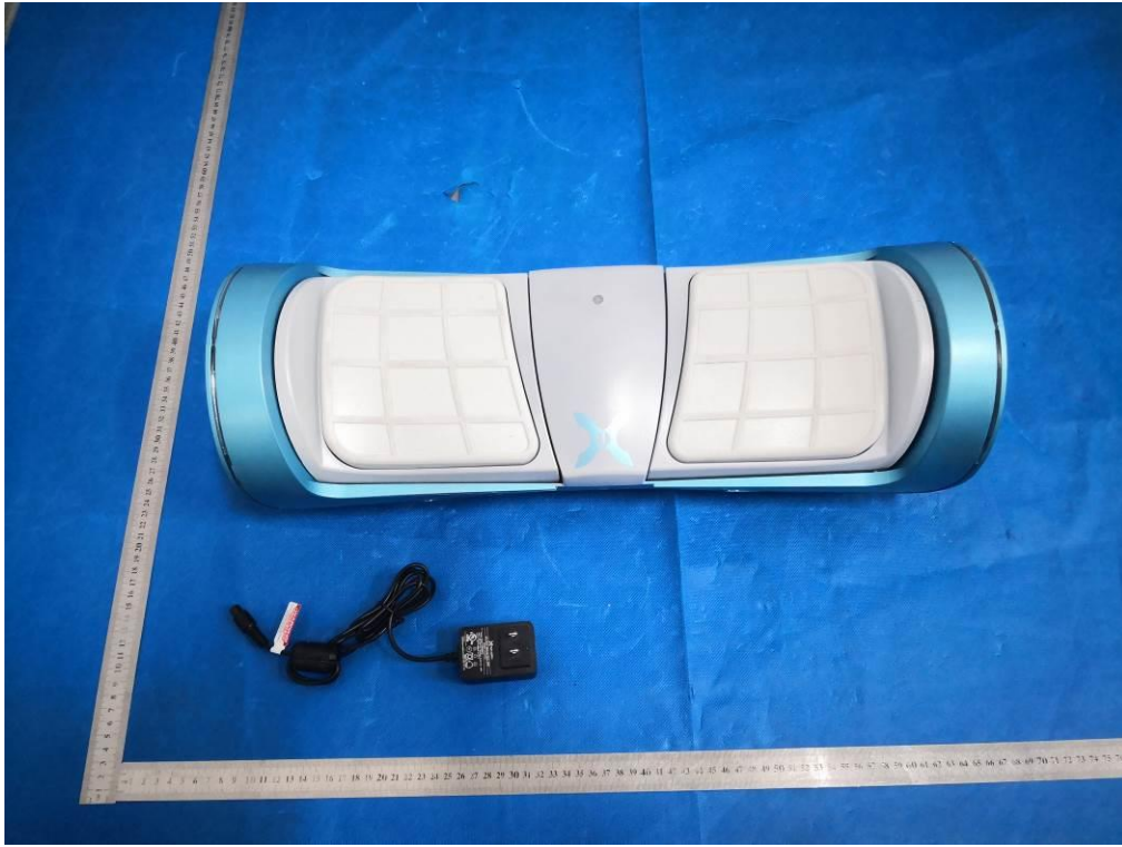
TOP VIEW OF EUT