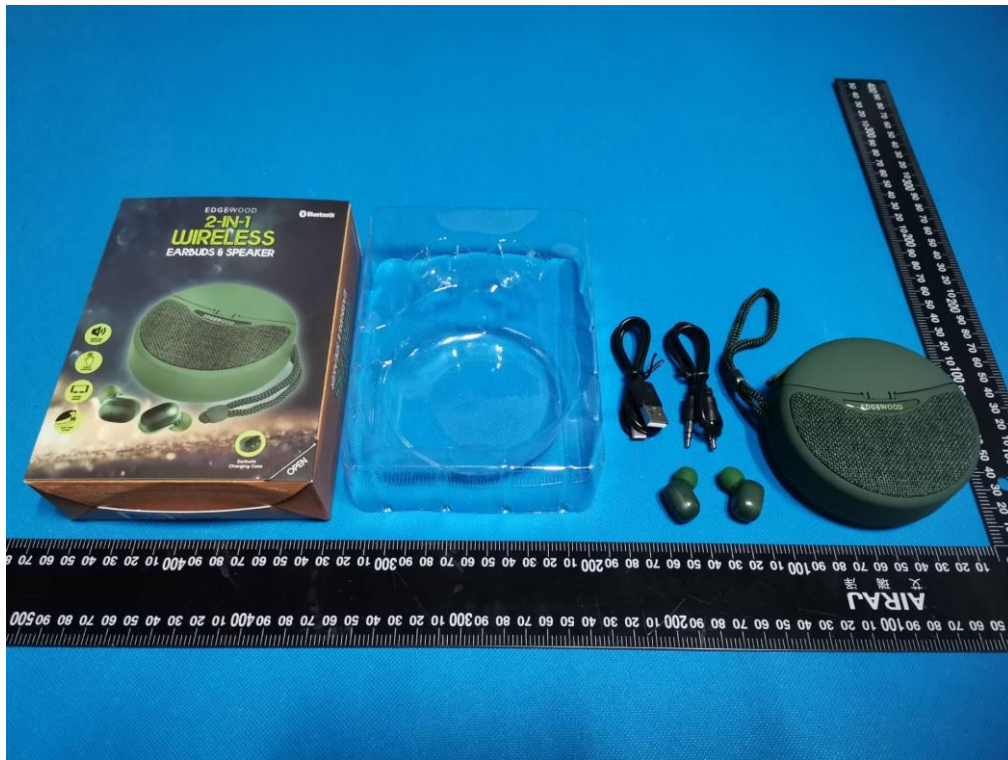
All VIEW OF EUT-2