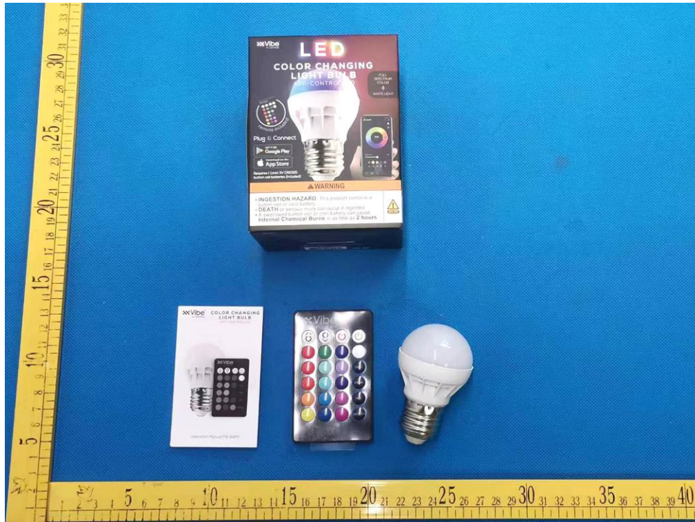
ALL VIEW OF EUT(FIGURE 2)