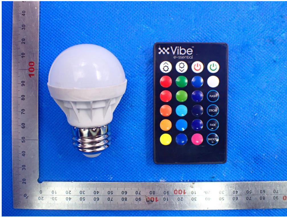
TOP VIEW OF EUT