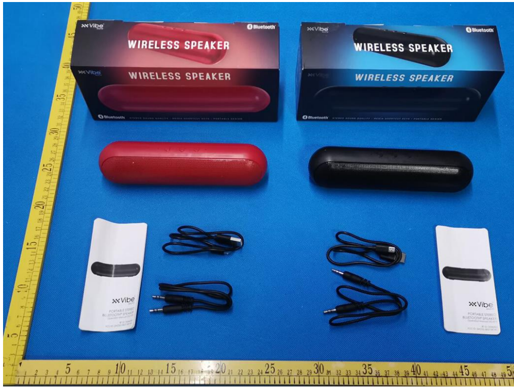
All VIEW OF EUT (FIGURE 2)