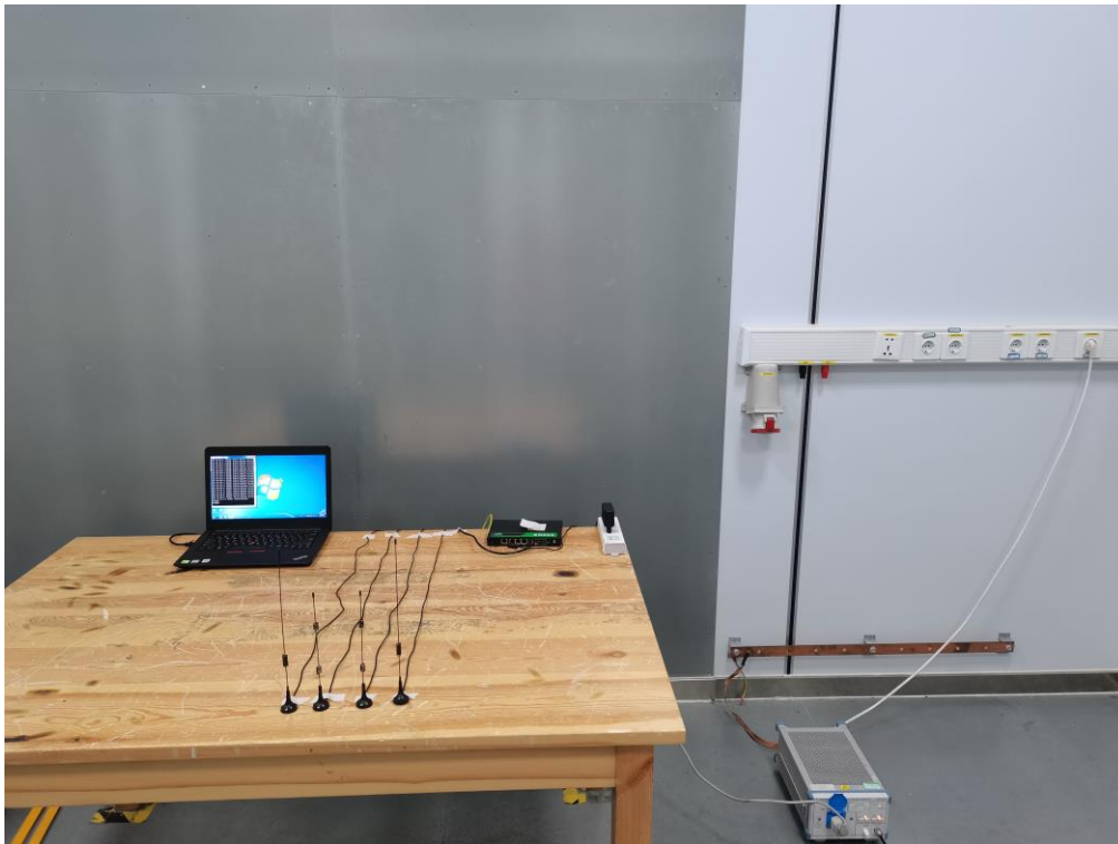
Fig. 4 Power line conducted emission setup photo