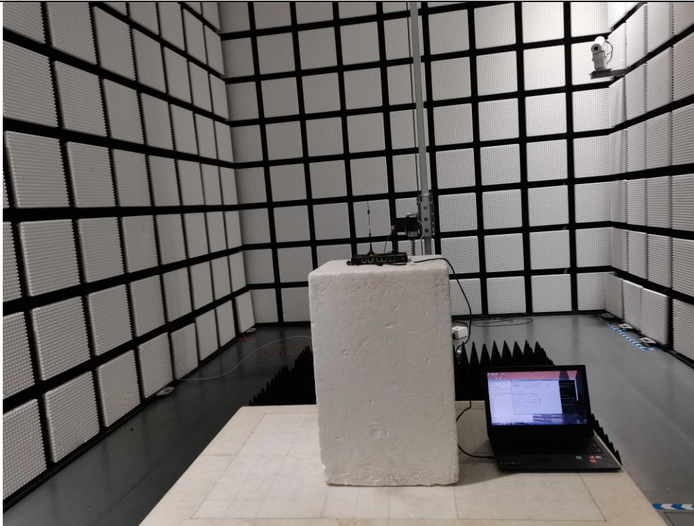
Fig. 3 Radiated emission setup photo(Above 1GHz)