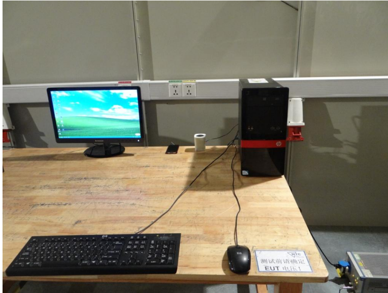
Radiated emission (below 1G)