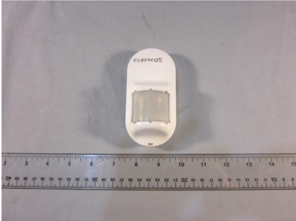
VSW1301 Wall Mount Occupancy/Vacancy Sensor, Top External View