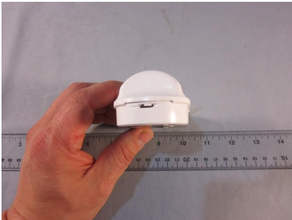
VSW1301 Sensor, Opposing End External View