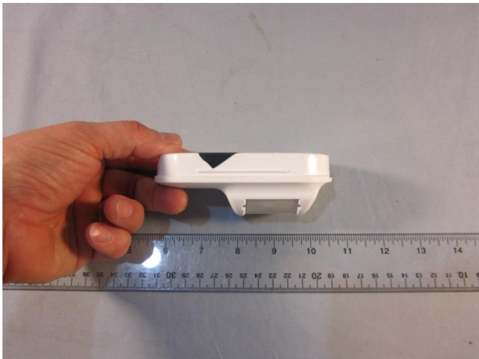
VSW130 Sensor, Opposing Side External View