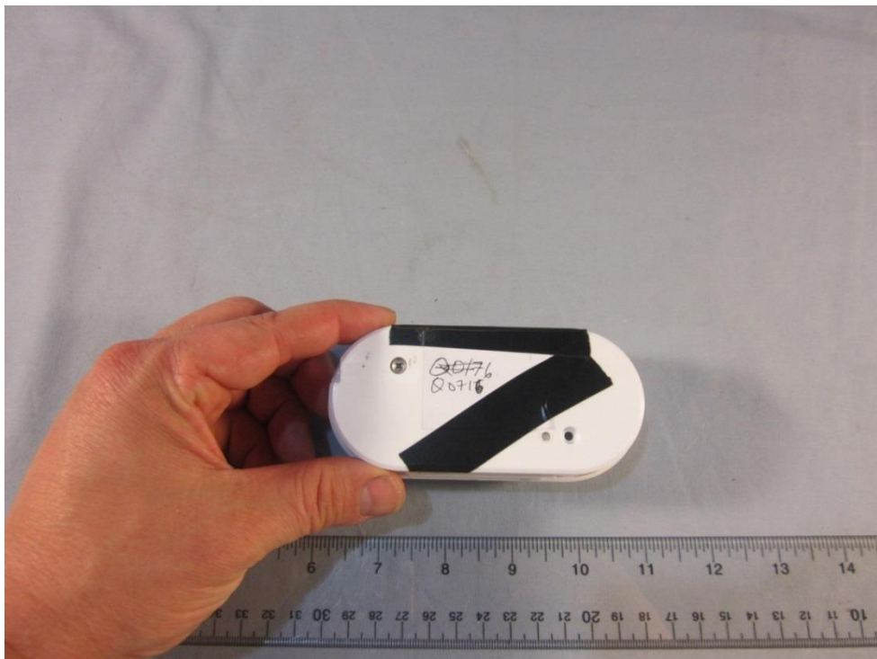
VSW1301 Sensor, Bottom External View