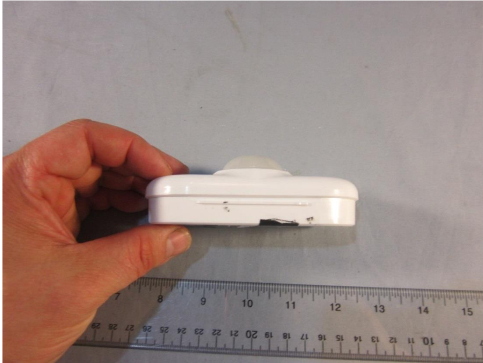
VSC1302 Ceiling Mount Occupancy/Vacancy Sensor, Side View