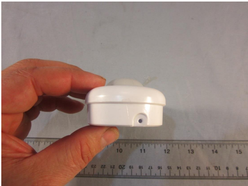
VSC1302 Sensor, Opposing End View