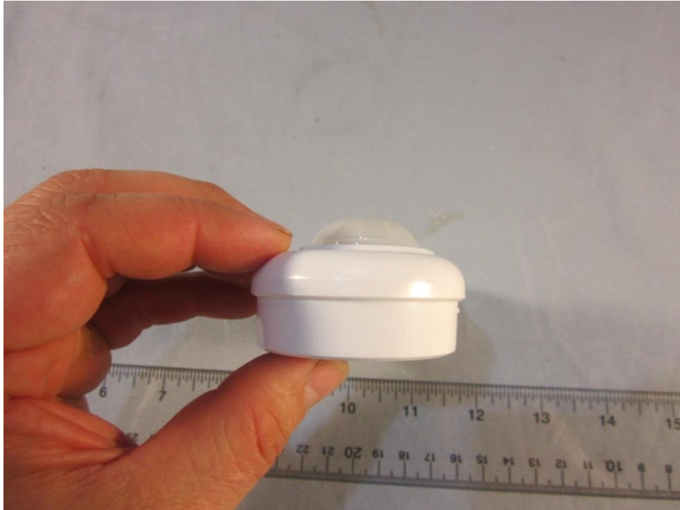
VSC1302 Ceiling Mount Occupancy/Vacancy Sensor, End View