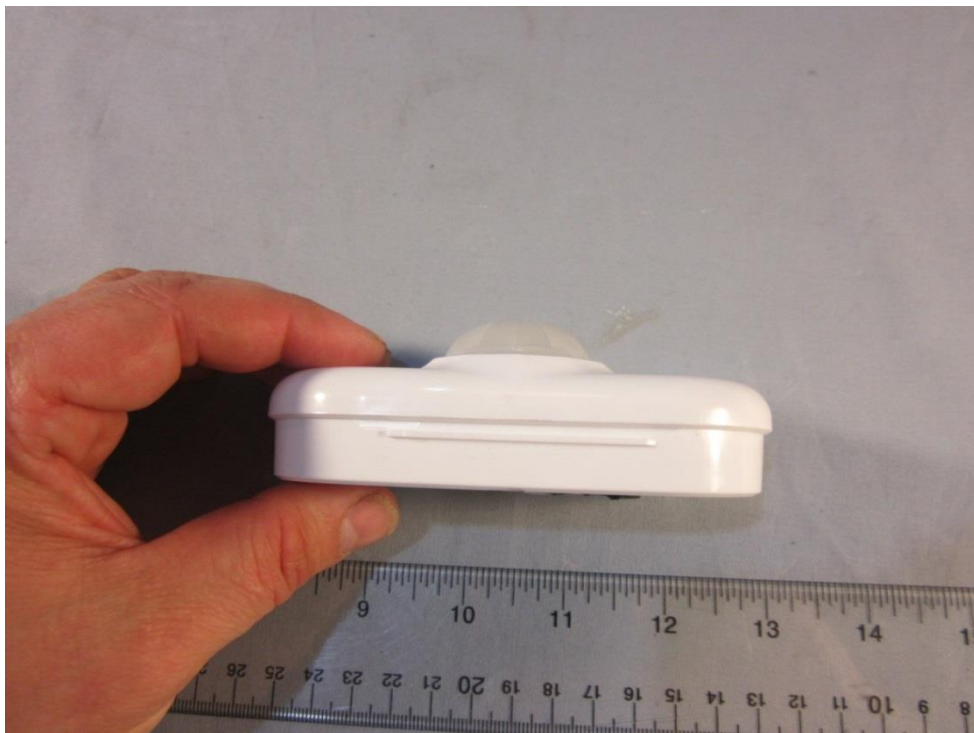
VSC1302 Sensor, Opposing Side View