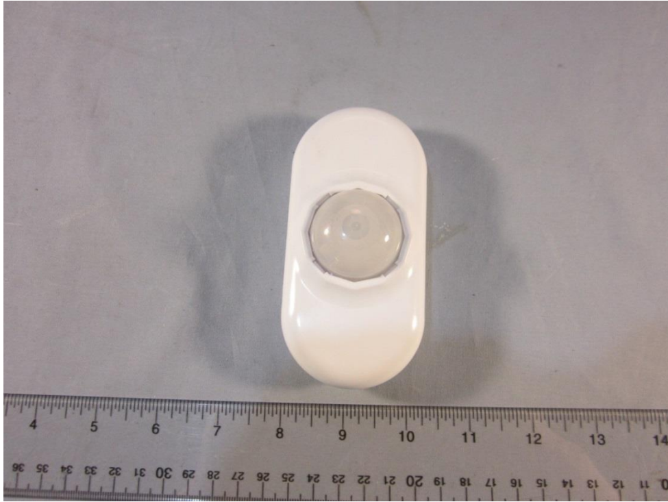
VSC1302 Ceiling Mount Occupancy/Vacancy Sensor, Top View