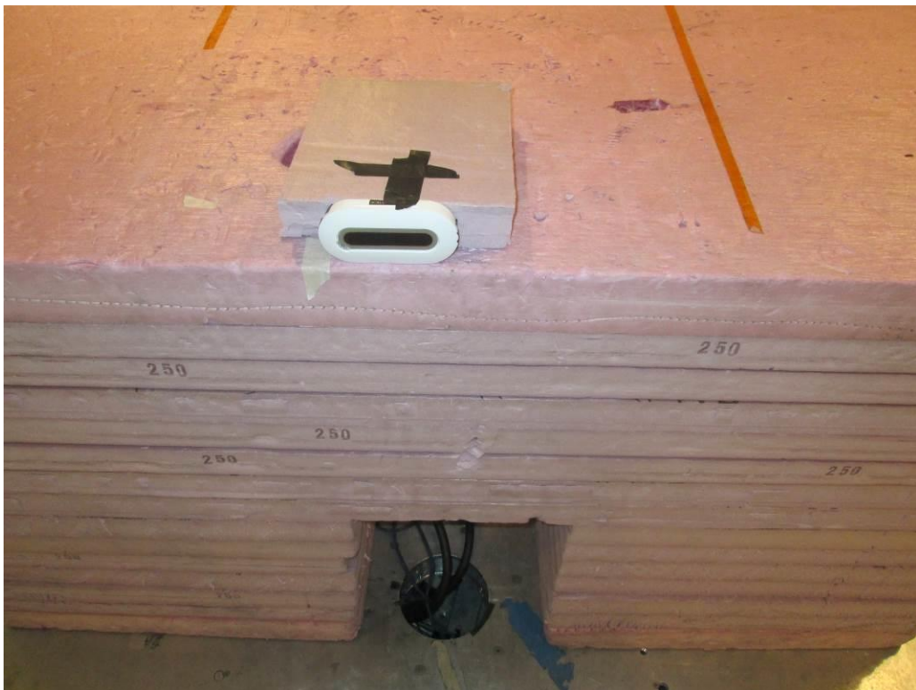
EUT - Z-Orientation