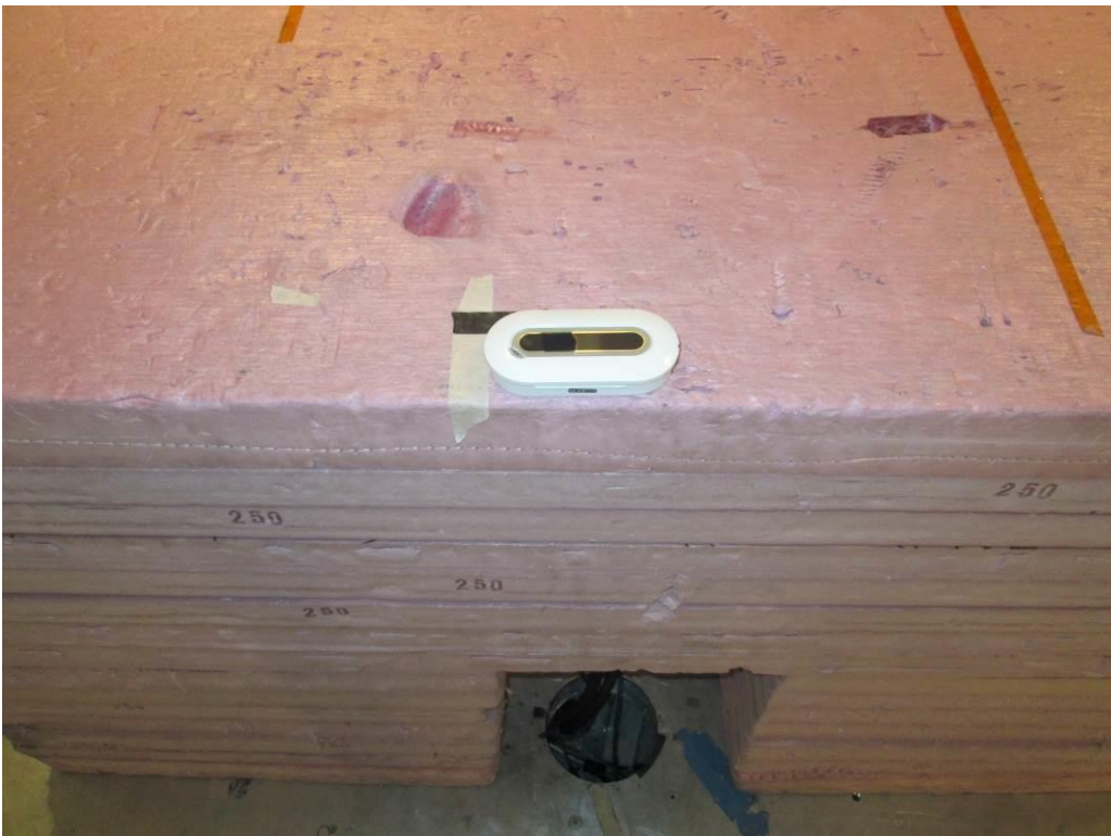
EUT - X-Orientation