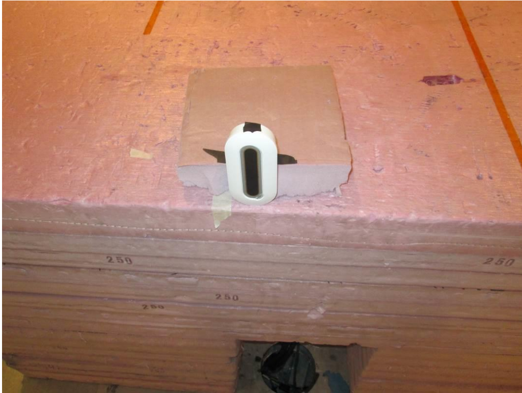
EUT - Y-Orientation