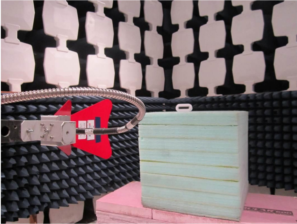
Radiated Emissions - 6 to 10 GHz