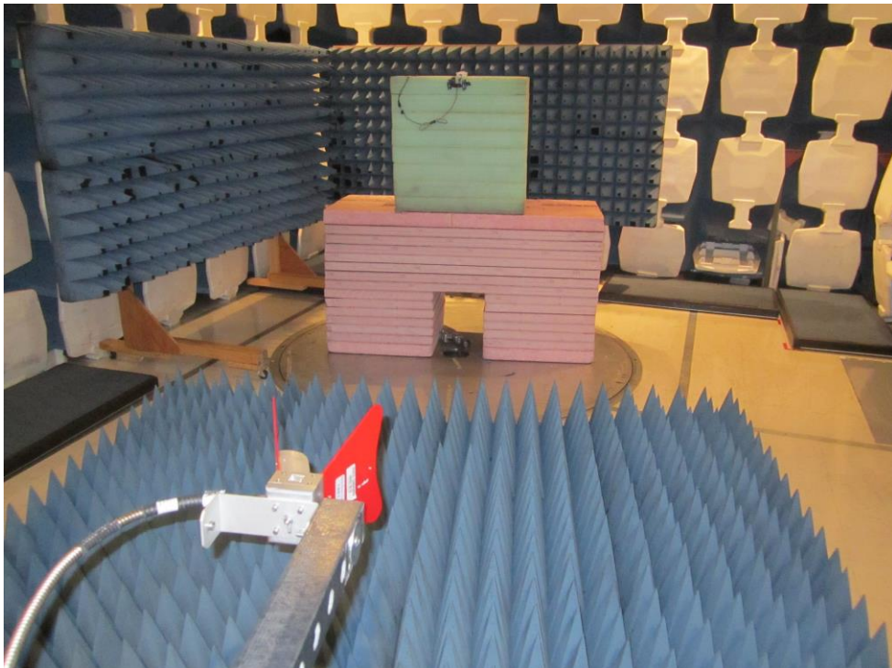
Radiated Emissions – 1 to 6 GHz