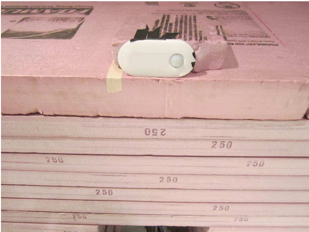
EUT - Z-Orientation