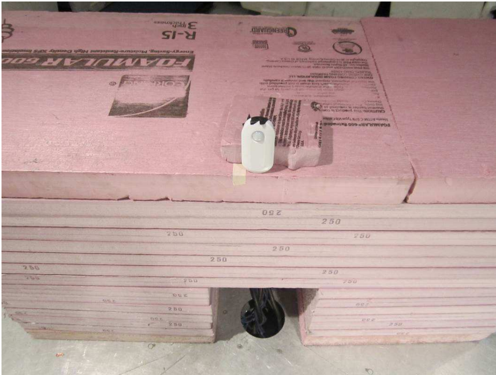
EUT - Y-Orientation