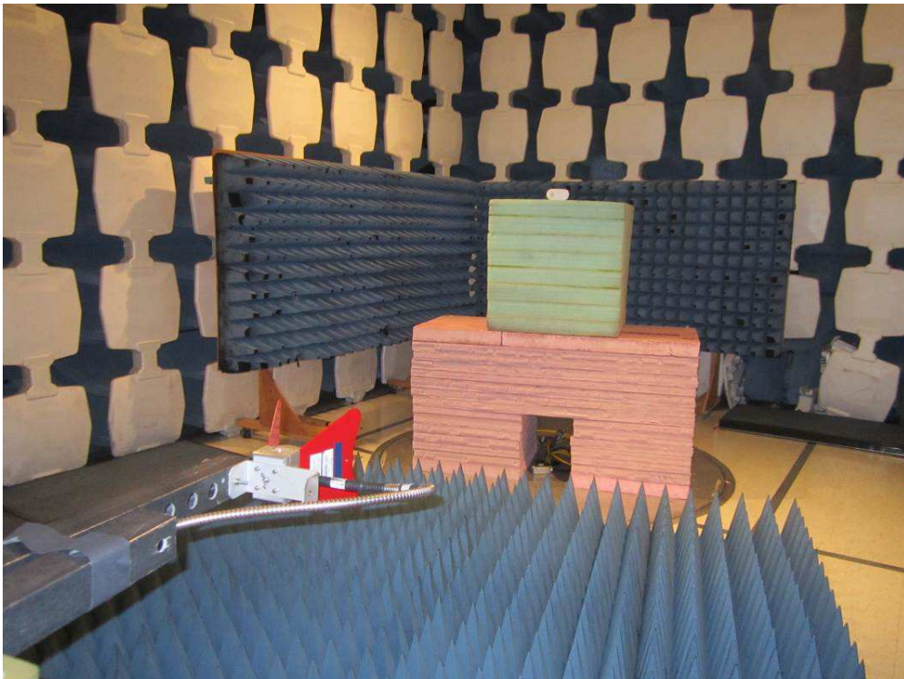
Radiated Emissions - 1 to 6 GHz