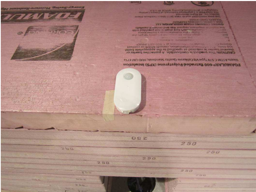
EUT - X-Orientation