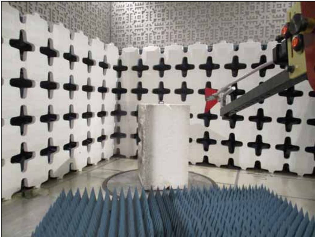
Test Setup for Spurious Radiated Emissions above 1GHz – Horizontal Polarization