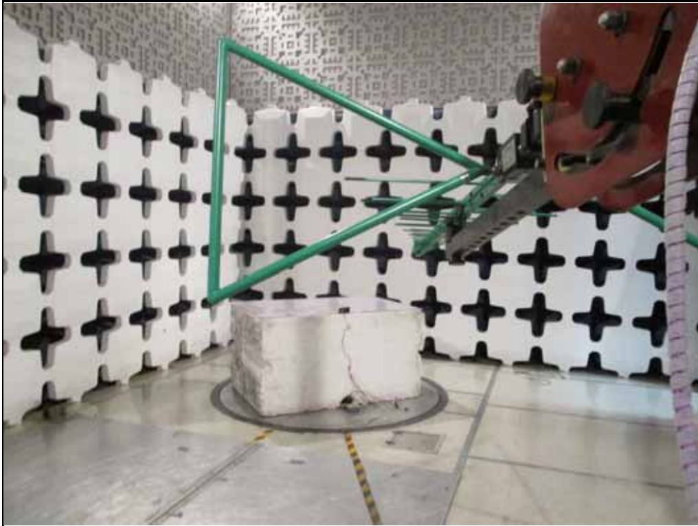
Test Setup for Effective Isotropic Radiated Power – Horizontal Polarization