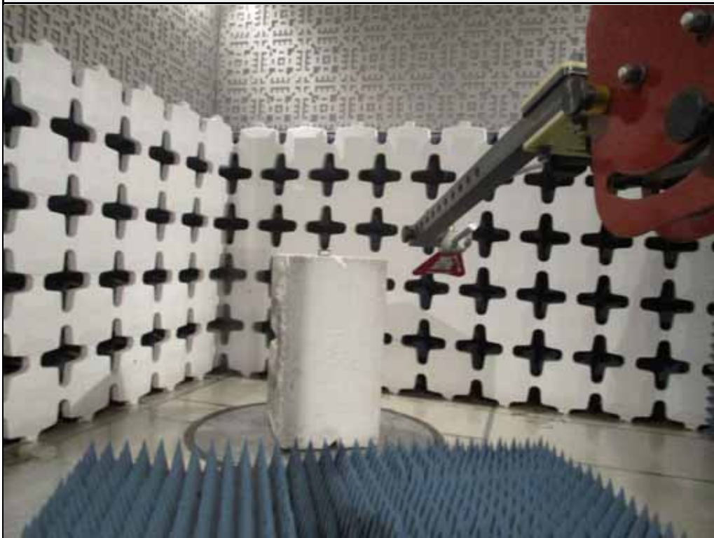
Test Setup for Spurious Radiated Emissions above 1GHz – Vertical Polarization