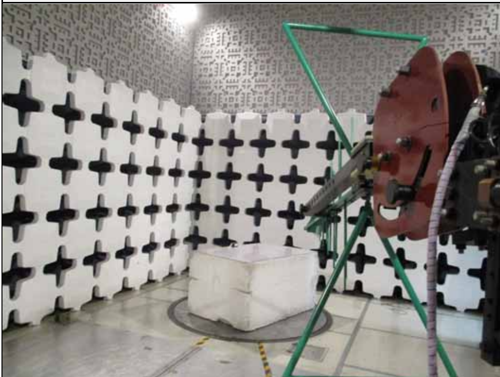
Test Setup for Effective Isotropic Radiated Power – Vertical Polarization