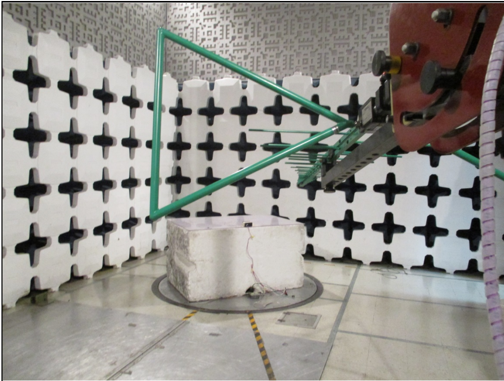
Test Setup for Effective Isotropic Radiated Power – Horizontal Polarization