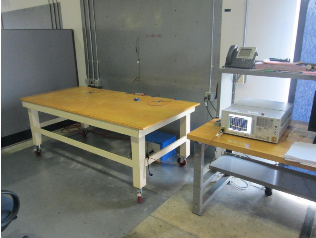
EMI Conducted – AC Mains (Front - 0.15 to 30 MHz)