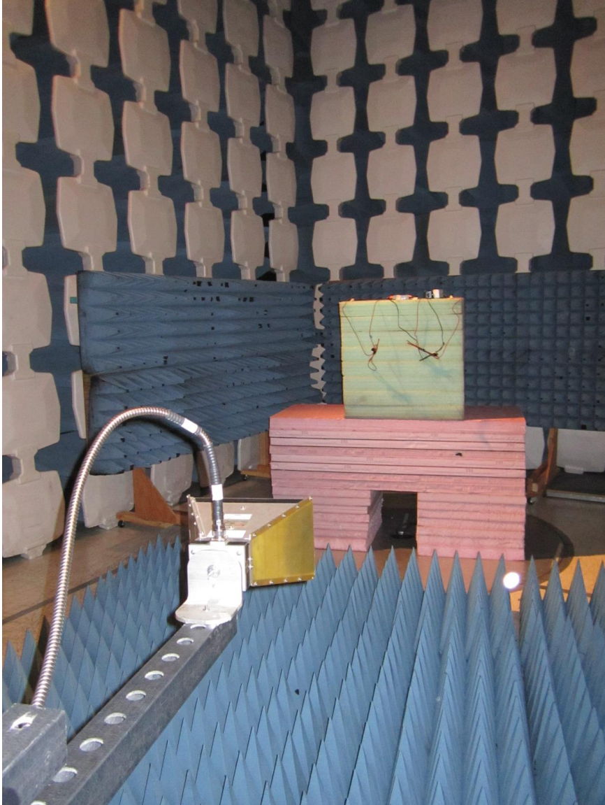
EMI Radiated – 1 to 6 GHz