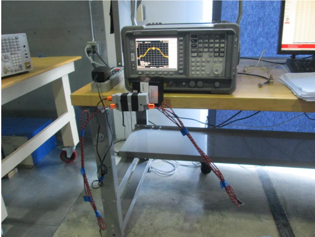
EMI Conducted at the Antenna port