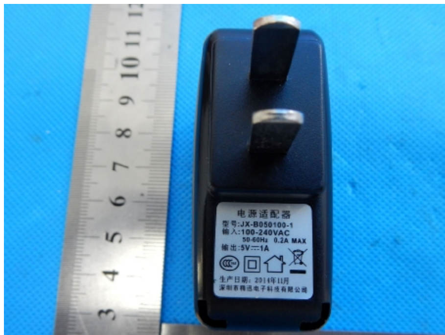
Lab provides adapter