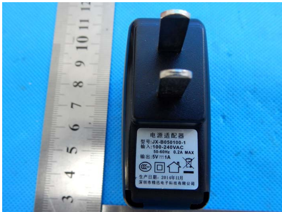
Lab provides adapter